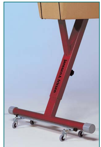
transport trolley ref. 1522080