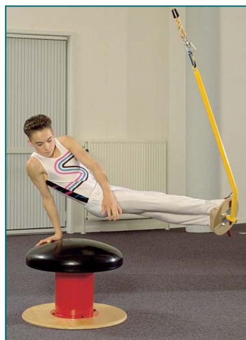
pommel stirrup ref. 1403200