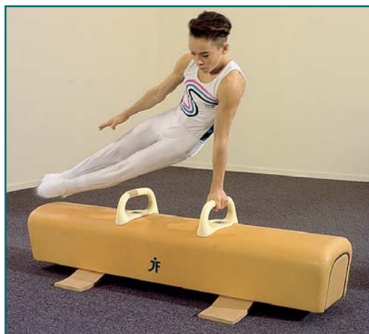
pommel trunk ref. 1407070

Height: adjustable from 110 to 150 cm with 5 cm increments. Competition height: 115 cm. Length x width: 160x35 cm Pommels: width adjustable from 36 to 48 cm, covered with a newly developed high-quality rubber compound for an improved grip, mounted on an alloy base. Body: covered with a high-density foam and first-class chrome leather. Supports: heavy-duty epoxy-coated wide gage steel tubes with nonmarking floor protectors. Tension system: Y-shaped chain with tension swivel and 4 D-shackles. Anchoring: 1 floor anchor 1384121 (not included). Floor occupation: 180x95 cm (on competition height 115 cm).