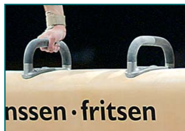
new pommel ref. 2200520