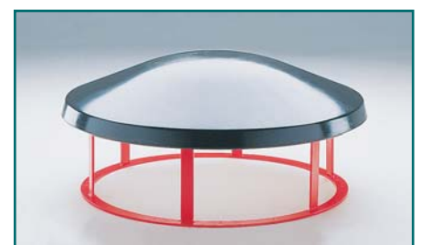
mushroom wide ref. 1395020