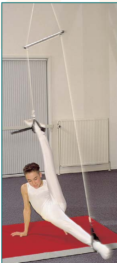
Thomas Flair appliance ref. 1403210