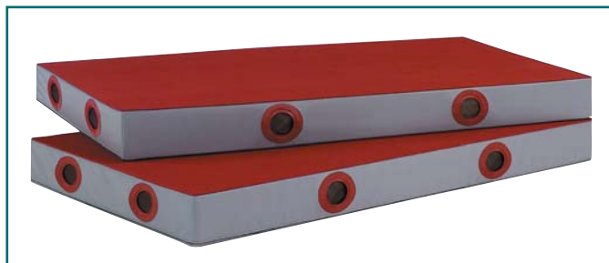
'club' landing mat ref. 1564008 / 09