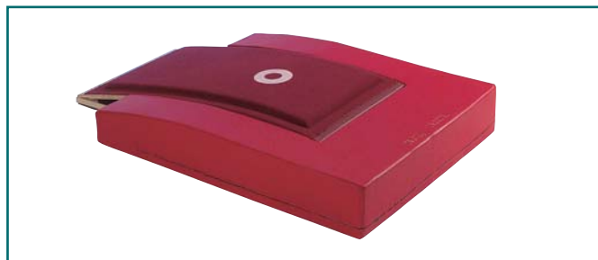
rondat mat ref. 1595301