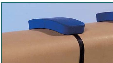
pommel pad ref. 1407071