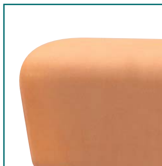
first-class chrome leather cover

This Top Competition Janssen-Fritsen product is FIG certified and is praised for its stability and wearproof quality. The newly developed rubber compound pommels provide an excellent grip under all circumstances, requiring less magnesia. The rigid wooden body, covered with carefully chosen foam and first-class chrome leather offers a comfortable firm touch and the right amount of stability at all times. The pommel horse comes with a built-in transport system for easy manoeuvring and a galvanised Y-shaped fixation chain and tension swivel.