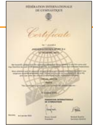
FIG CERTIFIED COMPETITION MODEL